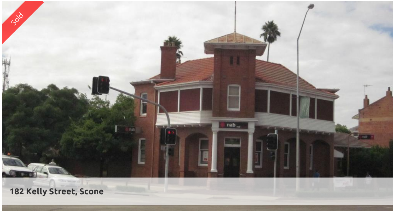
182 Kelly Street, Scone