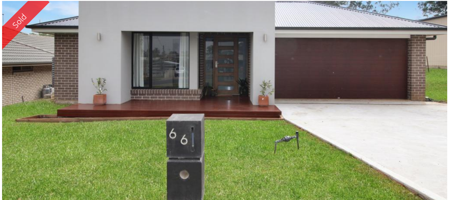
66 St Andrews St, Aberdeen